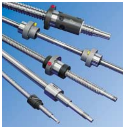
SKF Ball & Roller Screws