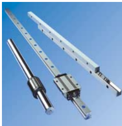
SKF Guiding Systems