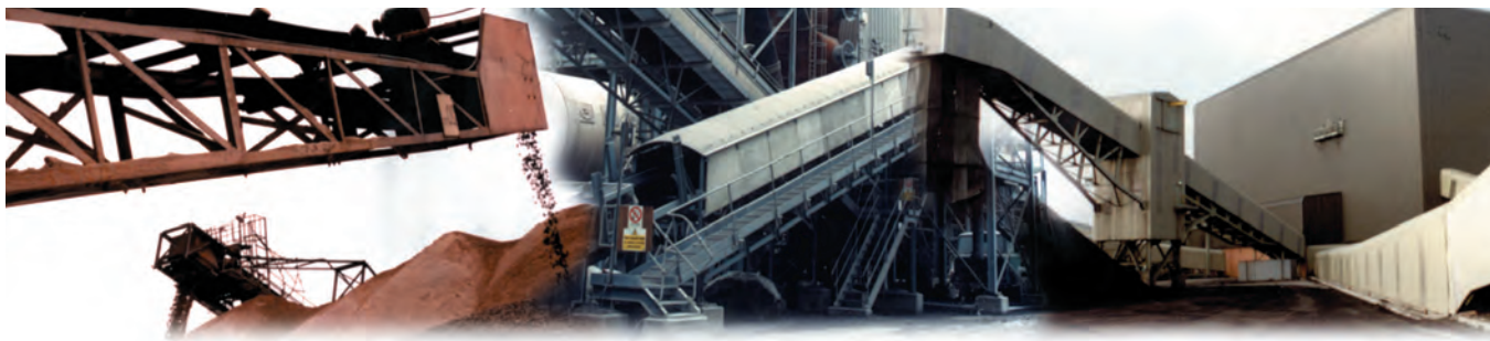
RMC Chalk Conveyor