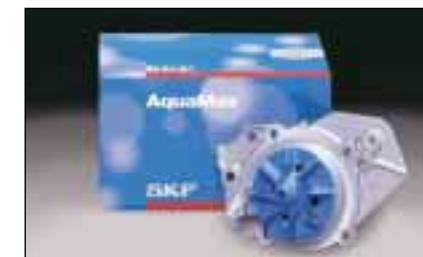
SKF AquaMax Water Pumps