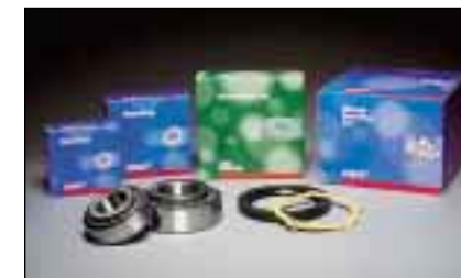
Wheel Bearing Kits for Commercial Vehicles