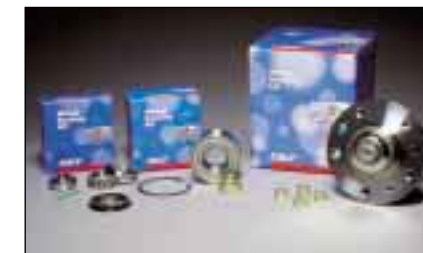
Wheel Bearing Kits for Cars

SKF provides a full line of kits for water pumps, timing and auxiliary belts, wheel bearings, clutch release bearings and suspension assemblies. Quick, precise product delivery is assured by the SKF European Distribution Centre, the largest and most sophisticated facility of its kind in Europe. Comprehensive catalogues and Electronic Data Interchange (EDI) make it easy to get your customers the products they need.