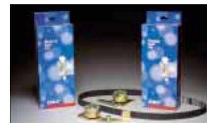
Multi-V and Timing Belt Kits