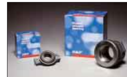
Clutch Release Bearings for Cars and Commercial Vehicles