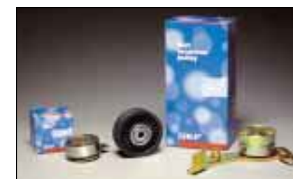
Belt Tensioner Pulleys for Cars