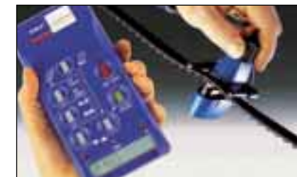
SKF TensiCheck Timing and Multi-V Belt Tension Tester