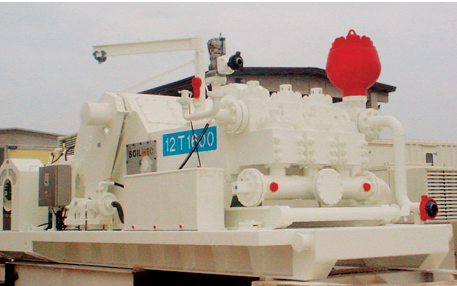
SOILMEC Triplex Pump 12T 1600